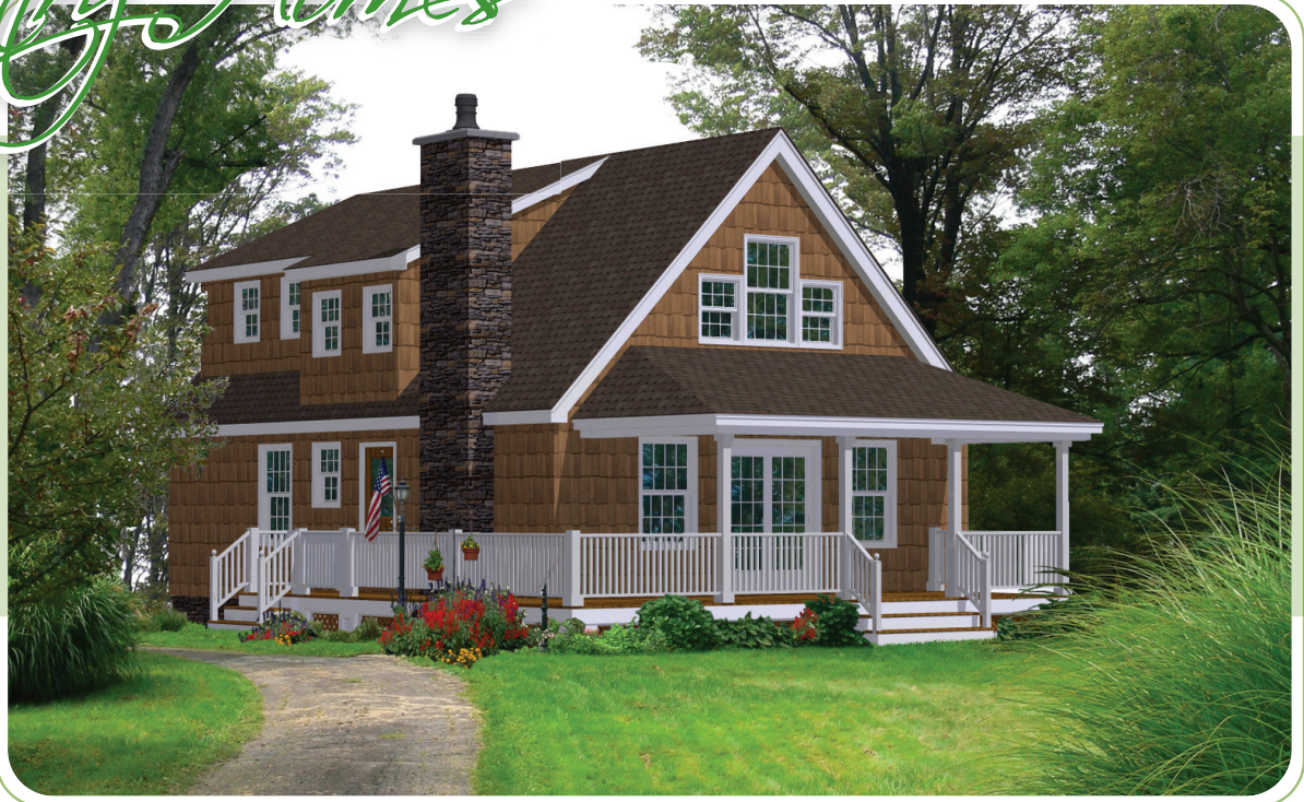
The Country Manor